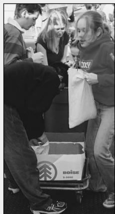
Students from Head Royce School in Oakland helped lift nearly one million pennies into the Pennies Truck. Together, their school raised over $9,200 for AEF clients! See related story on page 3.